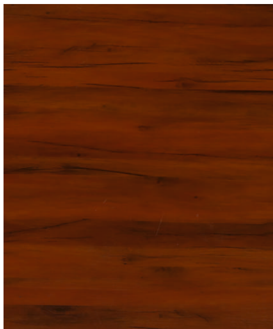
ASH 810 MAHAGONY