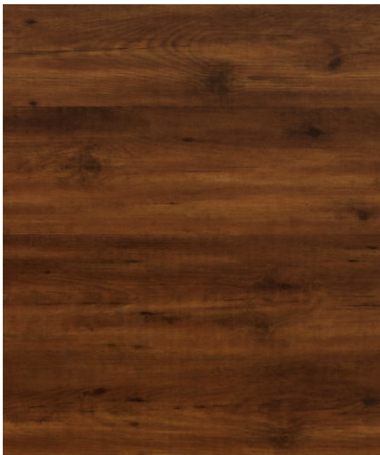
ASH 823 NOVECENTO PINE