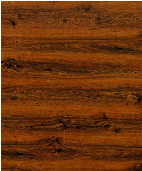
ASH 819 ROVER OAK