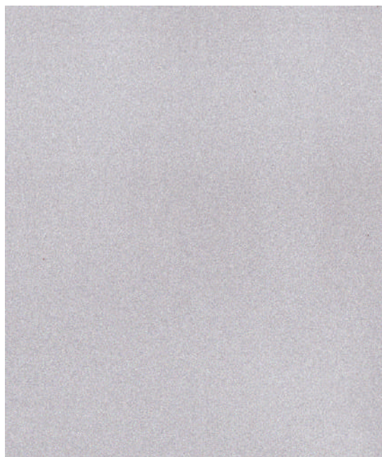
ASH 801 METALLIC SILVER