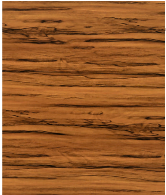
ASH 820 BROWN SANTOS